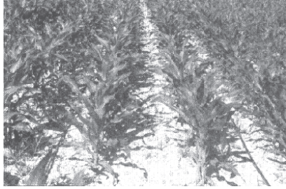
FIGURE 7.3 - Sprinkling with treated municipal water.